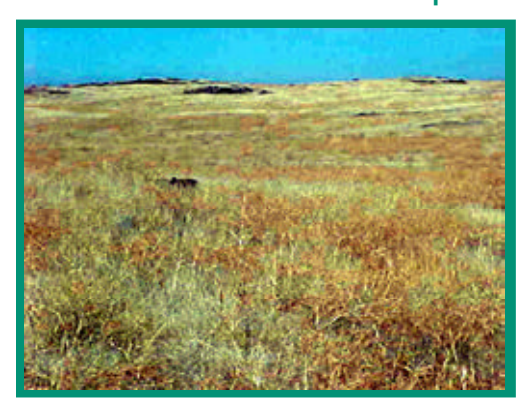
Cheatgrass and weeds grow in the Hidden Valley area of south central Idaho, showing some of the most flammable fuels in the district.

In implementing the National Fire Plan, South Central Idah BLM has also signed agreements for hazardous