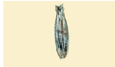
Badly Ground / Weather Damage