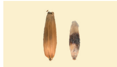
Weather Damaged (Stained)