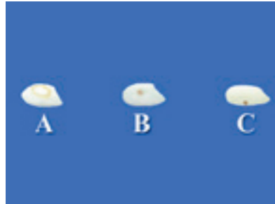
WATER, STAIN, & PECK DAMAGE (Glutinous Rice)