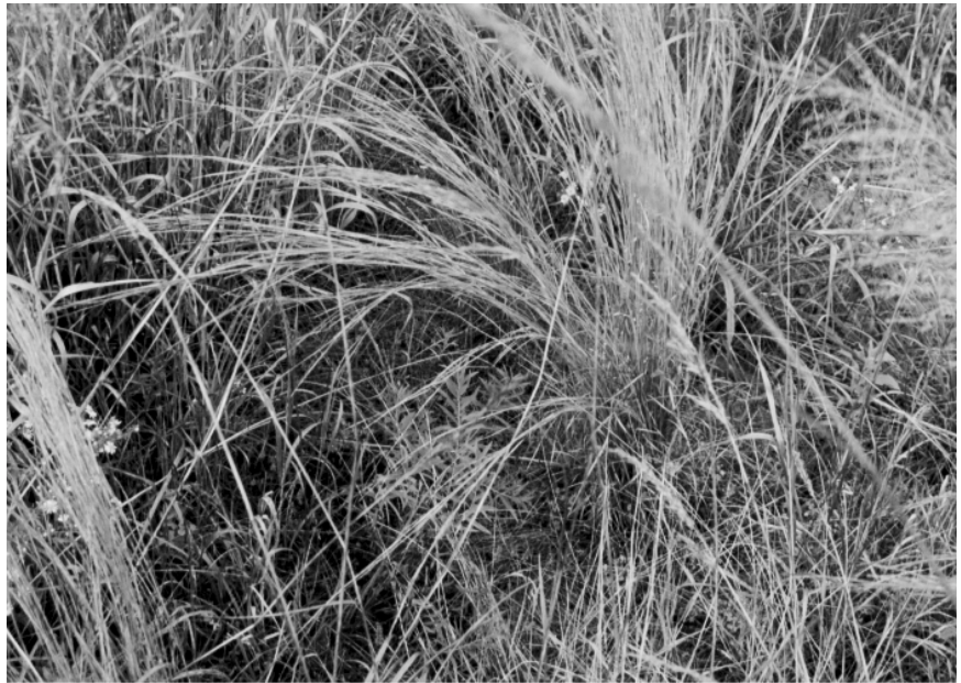
The growth form of native bunch grasses provides excellent nesting sites for bobwhites. Open passageways among grass clumps also enable bobwhites to travel easily and safely along the ground.

Brood-rearing cover differs from nesting cover because it is generally more open at ground level to enable movement of quail chicks. As much as 70 percent of brood-rearing cover can be open, bare ground. Whereas good nesting habitat has generally not been disturbed for two or three growing seasons, the best brood habitat occurs within the first year following disturbance of an area through burning, disking, timber harvest, or other means. Overhead concealment, diversity of low-growing green foliage, and abundant insects are required brood-rearing cover characteristics. Recently burned grasslands, old field communities, weedy field borders, legume plantings, and small grain fields provide good brood-rearing cover.