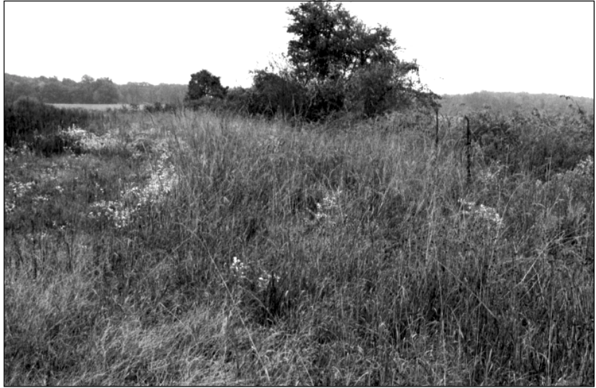
A diversity of early successional plant communities exposed to regular disturbance is key to providing ideal bobwhite habitat.

Quail occupy a wide variety of early successional habitats, including active and fallow crop fields, pastures, old fields, native grasslands, hedgerows, brushy fencerows, woodlands with grass and forb ground cover, open meadows with a shrub or brushy component, cut-over timberlands, roadway and powerline rights-of-way, wooded riparian areas, brushy canyons and hillsides, and rural residential areas. The role of regular habitat disturbance in maintaining productive bobwhite habitat is extremely important. Disturbances, such as fire, timber harvest, grazing, and disking, are necessary to maintain the early successional habitats used by bobwhites. A principle aspect of these early successional habitats is the presence of grasses and forbs