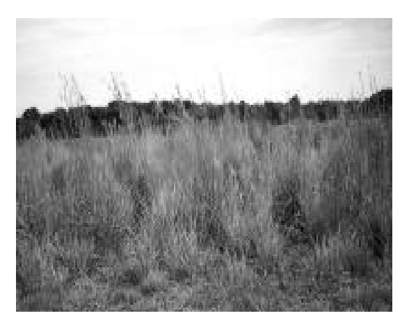
Native grasses provide good wild turkey brood-rearing habitat.

Spring seeps - In many forested areas, wild turkeys use spring seeps as a reliable source of surface water. Immature trees lining seeps can be thinned to open the area surrounding the seep and promote growth of grasses and increase vegetative diversity. Mature mast-producing trees along seeps should not be disturbed, and a buffer of undisturbed vegetation of at least 50 feet wide should be maintained around seeps in areas where farming practices, livestock grazing, or timber harvesting occurs. Fencing of livestock may be necessary to protect seeps and riparian zones in pasturelands. Oaks, serviceberry, and other fruit and seed-producing trees and shrubs can be planted around open or old field seeps to provide food, and immature or less-valuable tree species can be girdled to create snags and maintain the area in an early developmental stage.