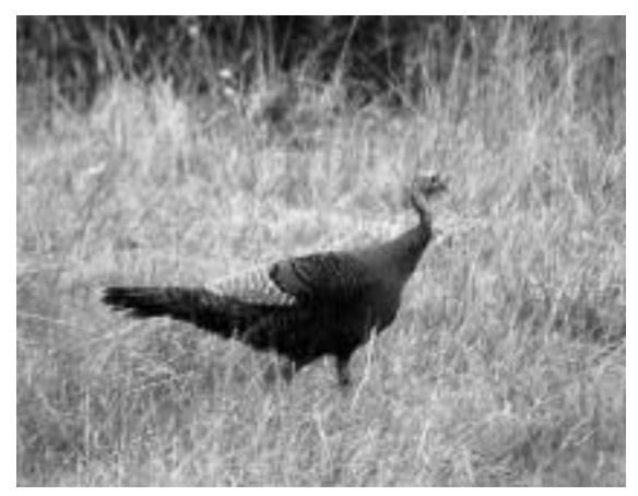
Wildlife Habitat Council