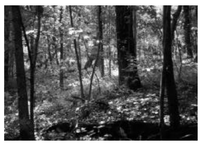
Forests with mature mast-producing trees and a diversity of understory vegetation provide nesting, roosting, and foraging opportunities for wild turkeys.

Wild turkeys roost on the ground and in trees. Tom and hen turkeys without broods roost overnight in trees to avoid predators. Tree roost habitat is found within continuous stands of timber. It is ideally comprised of mature, open-crowned trees with branches spaced at least 18 inches apart that run parallel to the ground, having trunk diameters of 14 inches or greater, and located within one-half mile of a food source. Mature pine, cypress, cottonwood and oak trees can provide good roosting cover. Ground roosting is most critical to hen turkeys during the first three to four weeks of brood-rearing, after which time poults are able to roost in trees with the hen. Hens with young roost under large trees within forests containing a dense understory of young trees and shrubs, downed trees, rock outcrops, and brushy