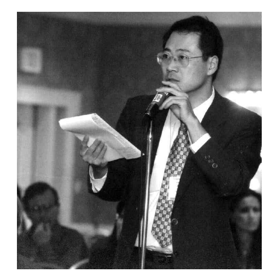
The world's top Alzheimer scientists exchange and debate research findings presented at World Alzheimer Congress 2000 in July.

Another key question is whether [CONT'D ON PAGE 11]