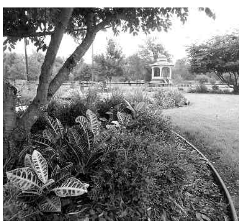
Memory gardens are designed with wide paths, nontoxic and fragrant plants, and a circular walkway with one entrance to prevent wandering.