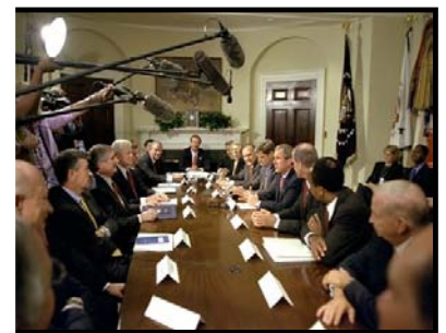
President Bush meets with business leaders in the Roosevelt Room.

The initiative is a self-directed, long-term effort to engage hundreds of America's business leaders in helping corporations, employees, and consumers answer the call to service that President Bush made during his State of the Union address.