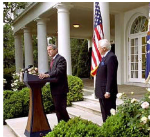
President Bush announces his history and civic initiatives in the Rose Garden. David McCullough, winner of the Pulitzer Prize for John Adams , introduced the President.

We love our country, and we must teach our children to do the same. And when we do, they will carry on our heritage of freedom into the future.