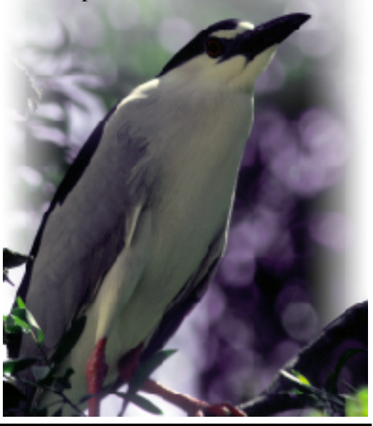
PWRC Fact Sheet 1999-18