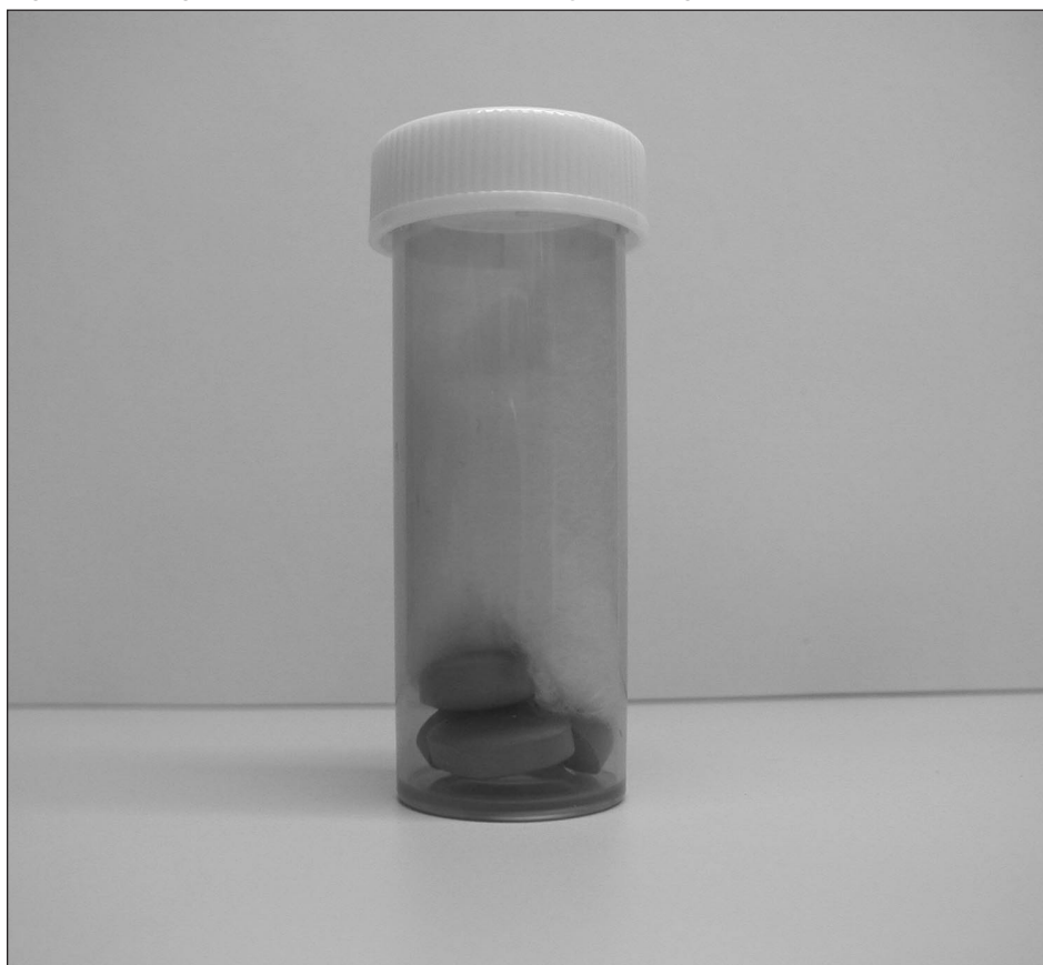
Figure 1: Drug Sample Received Without Any Warnings or Instructions

prescribed for individuals who are currently taking certain heart medications, as it can lower blood pressure to dangerous levels. Additionally, 2 samples of Roaccutan, a foreign version of Accutane, arrived without any instructions in English. (See fig. 2.) As noted, possible side effects of this drug include birth defects and severe mental disturbances. Compounding the concerns regarding the lack of warnings and patient instructions for use, none of the other foreign pharmacies ensured patients were under the care of a physician by requiring that a prescription be submitted before the order is filled.