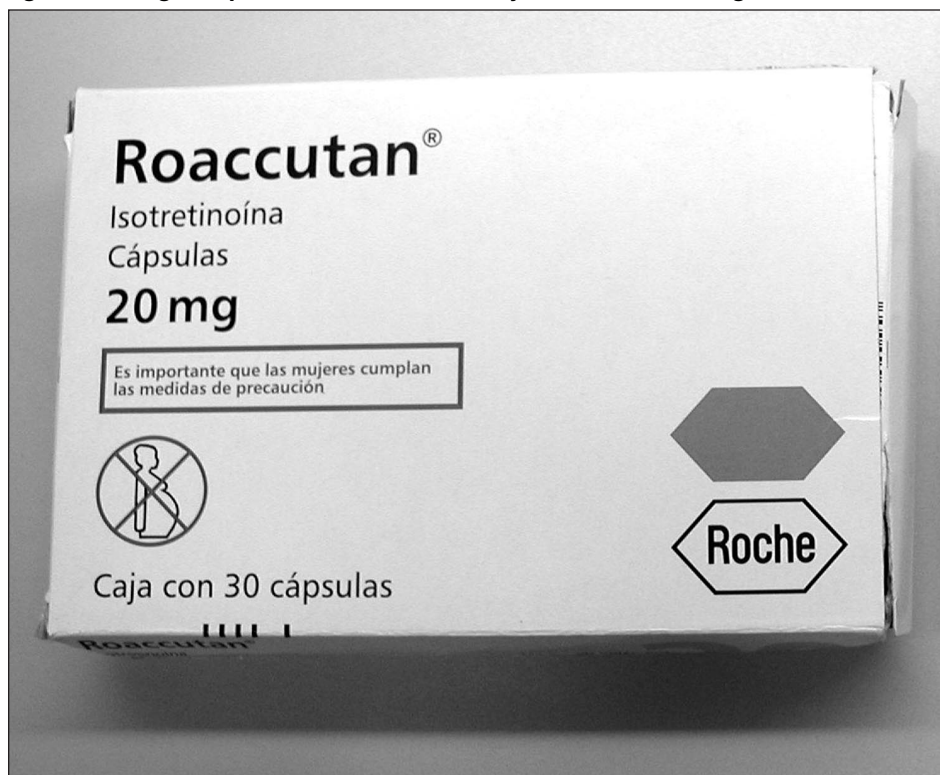
Figure 2: Drug Sample Received Without Any Instructions in English