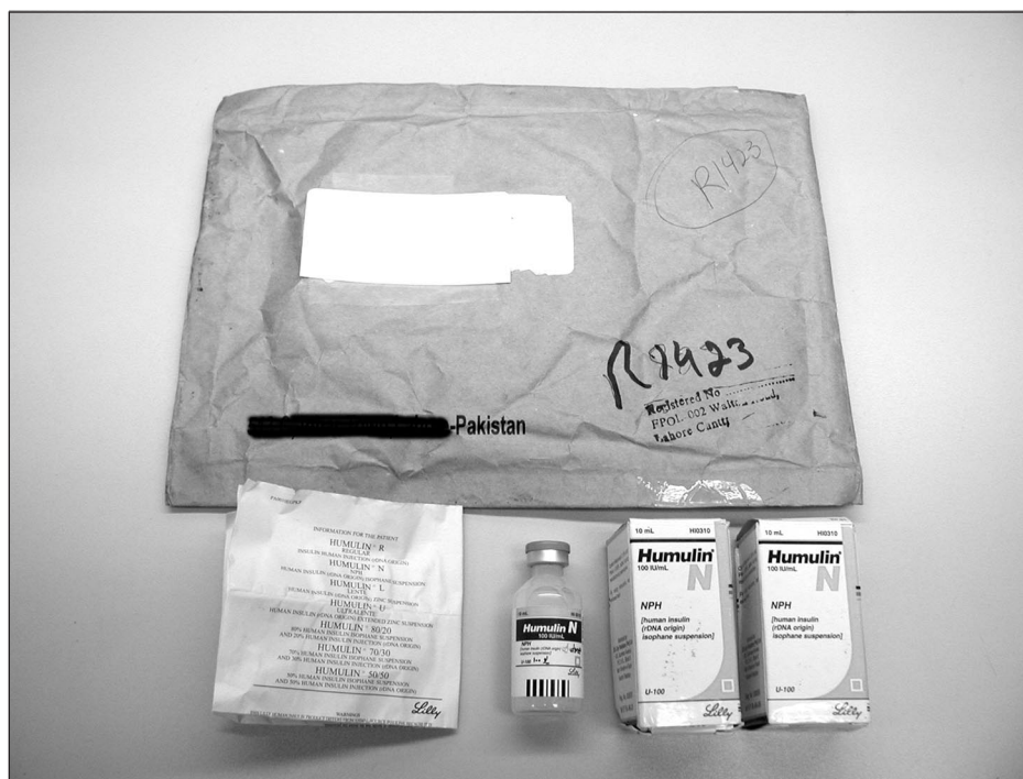
Figure 3: Drug Sample Shipped Improperly

samples we received were damaged and included tablets that arrived in punctured blister packs, potentially exposing pills to damaging light or moisture. (See fig. 5.) One drug manufacturer noted that damaged packaging may also compromise the validity of drug expiration dates.