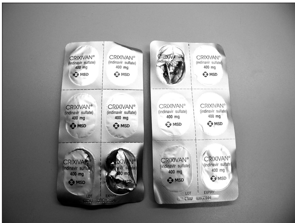
Figure 5: Drug Sample Received in Damaged Packaging