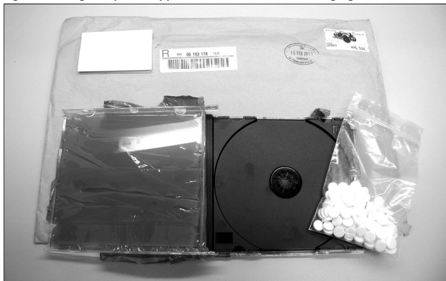
Figure 4: Drug Samples Shipped in Unconventional Packaging