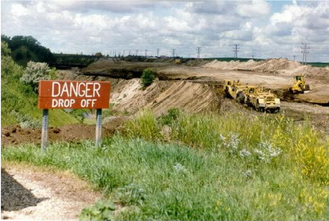
Custer reclamation project during reclamation in 1997.