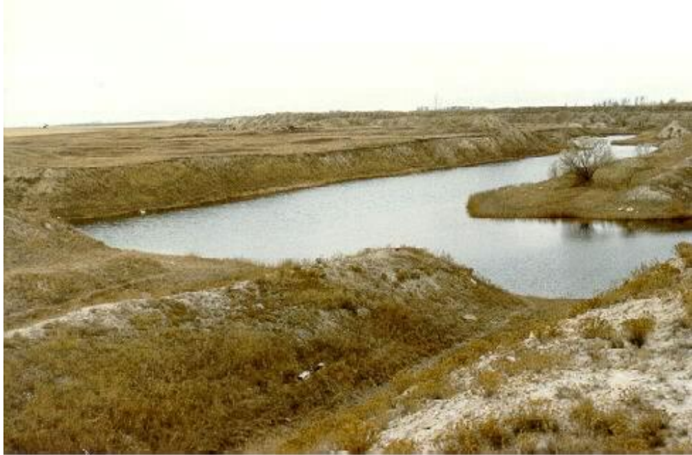
Bowbells project before reclamation in 1995.

The Bowbells Mine was a small abandoned surface mine that was reclaimed in 1995. It consisted of a dangerous highwall, an open pit and spoil piles. The highwall has been reclaimed to a safe slope and the old pit is now a wetland that is heavily utilized by waterfowl during the wet season and a grazing pasture for cattle when it is dry. The uniform slope of the reclaimed highwall is the only clue that a mine once operated on this property.