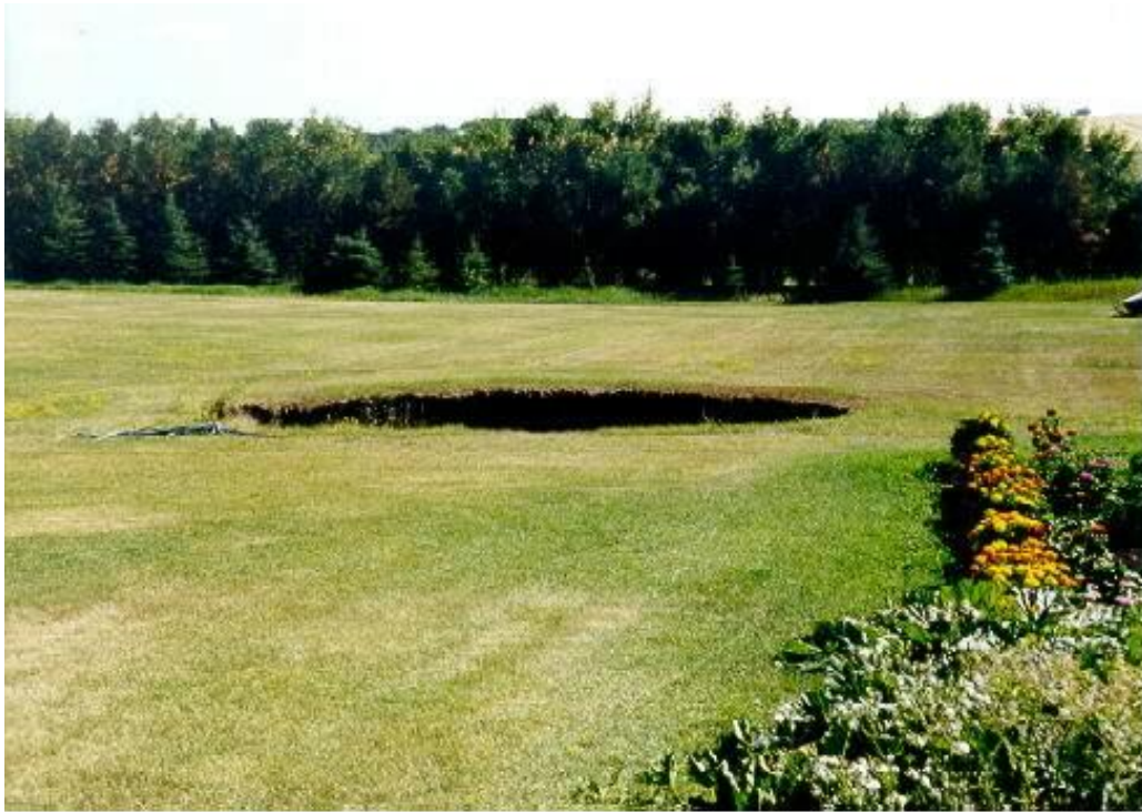
Wilton subsidence project before reclamation in 1999.