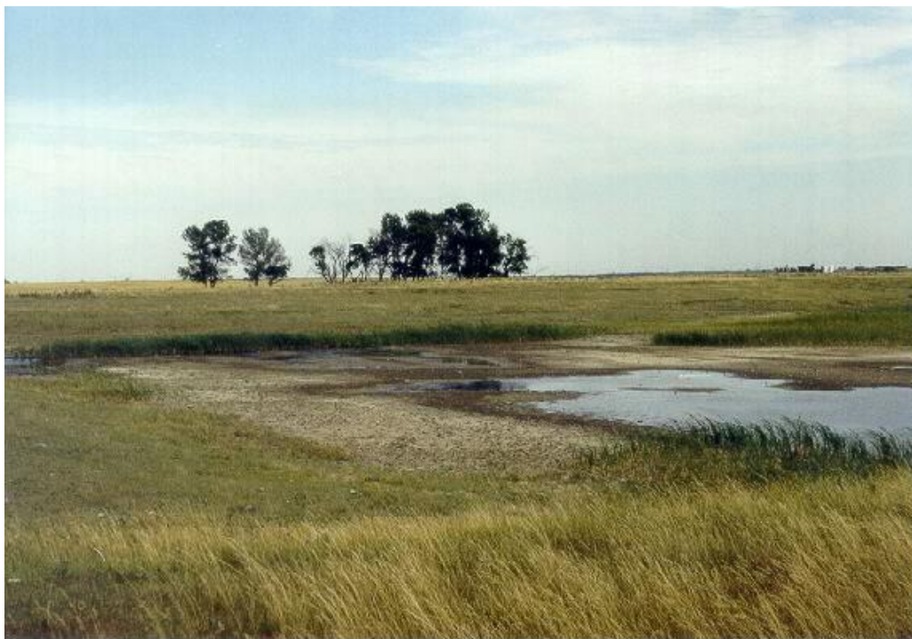
Bowbells project after reclamation in 2004.

The Columbus Mine project was in its fifth phase of reclamation when we visited the site. This is a large surface and underground abandoned mine that consists of several open pits, highwalls and large amounts of spoil. Some of