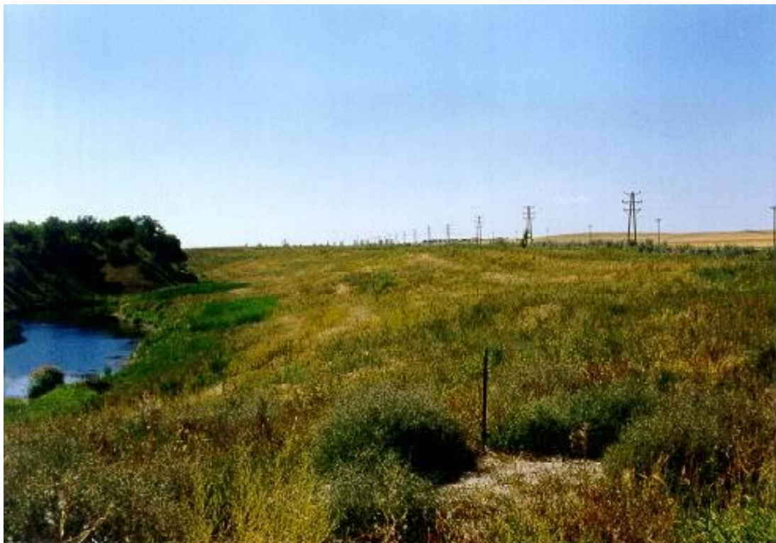
Custer reclamation project after reclamation in 2004.