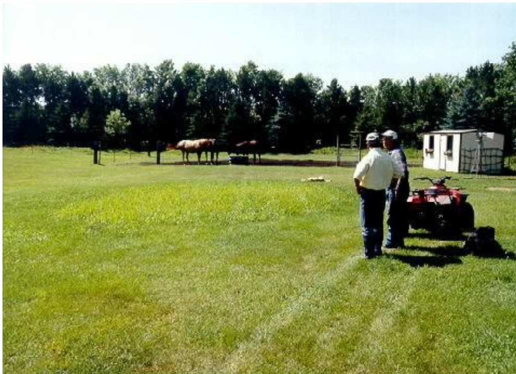
Wilton subsidence project after reclamation and maintenance in 2004.