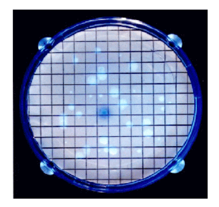
Figure 1. This photograph shows Escherichia coli (blue/green fluorescence) and total coliforms other than E. coli (blue/white fluorescence) on MI agar under longwave UV light (366 nm). The sample used was a wastewater-spiked Cincinnati, Ohio tap water.