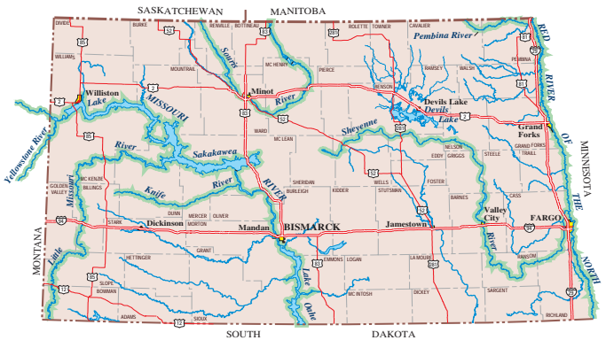
Rivers highlighted in green are monitored by U.S Geological Survey gages and have streamflow recommendations for canoeing.

Streamflow data obtained and evaluated before a river trip can prevent the disappointment and loss of time associated with a long drive to a favorite river, only to find it too low for a canoe trip. On the other hand, an adventurous canoeist may be willing to travel farther for a river outing, knowing that streamflow conditions on a favorite river are optimal. By using available streamflow information, recreationists can plan safe trips to match the conditions of the water or to match their own abilities or skill levels.