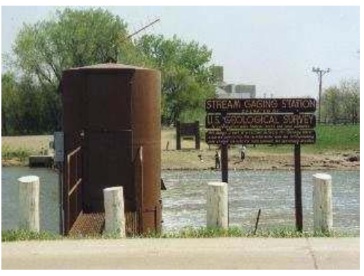
U.S Geological Survey gaging station with satellite antenna.

Streamflow and stage data are most commonly collected at gaging stations along rivers and streams. A gage house is constructed to hold equipment that measures and records stage (the height of the water surface above a fixed reference point near the gaging station) and streamflow (the rate at which water is flowing). However,