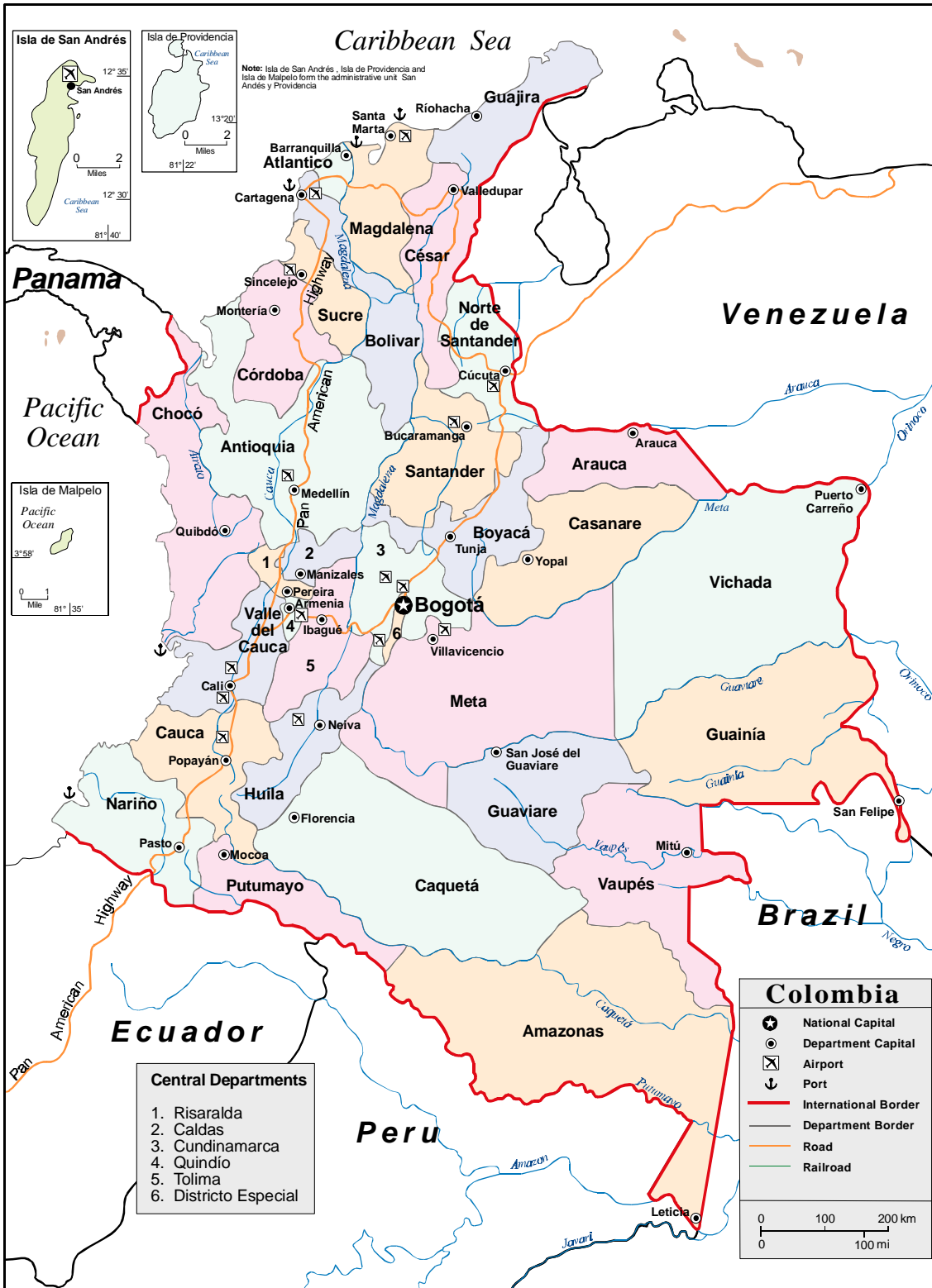
Figure 1. Colombia: Departments and Larger Cities