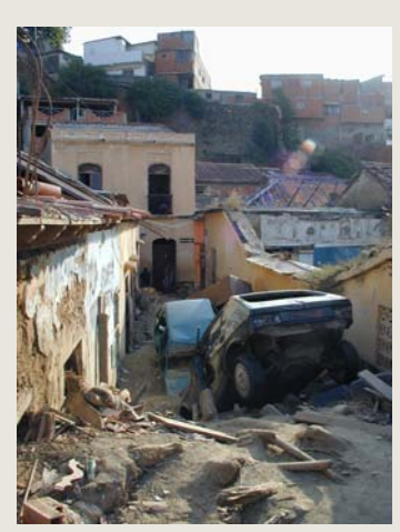
Mud, rocks, and other debris filled streets and houses in La Guaira.