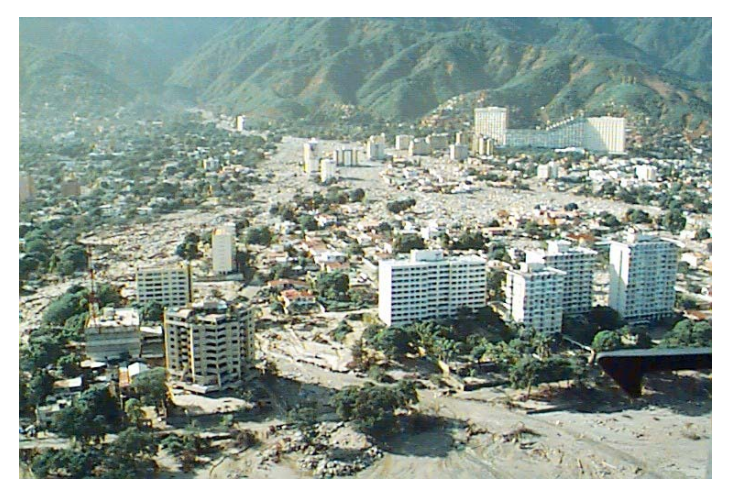
Aerial view of Caraballeda alluvial fan looking south, showing an estimated 1.8 million tons of freshly deposited sediment that was spread across the highly urbanized community by floods and debris flows in December 1999.

and initiate new, distinct flow paths of uncertain direction. The uncertainty of landslide risk can be heightened by sediment deposition in an alluvial fan channel, resulting in rapid overbank flooding of a channel that was