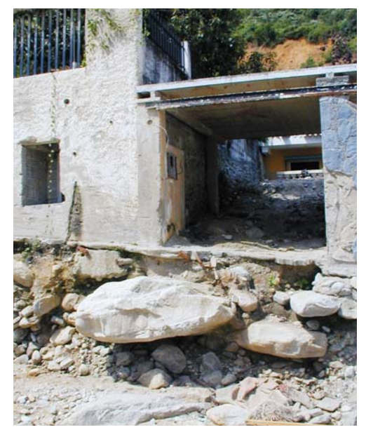
Erosion caused by the 1999 storm exposed the foundation of this house and garage in Caraballeda. The sand, cobbles and boulders upon which the structure rests are an old debris flow deposit.

flash-flood or landslide events per century have occurred in this region since the 17th century. Spanish archives indicate that flash floods and debris flows caused extensive damage to 219 homes and government buildings and destroyed all bridges in La Guaira in February 1798; the floods and debris flows associated with this event were so large that Spanish soldiers placed cannons cross-wise in front of the upstreamfacing entrance of a fort to barricade the structure near the stream channel.