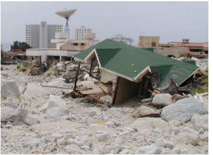
This house was carried and rotated by debris flows in Caraballeda, Vargas, Venezuela, 1999.

The landslides (mostly debris flows) and flash floods along the coastal zone of the state of Vargas and neighboring states in northern Venezuela killed an estimated 19,000 people, caused extensive property damage, and changed hillslope, stream channel, and alluvial fan morphology. Residents had little advance warning of the debris flows and flash floods that struck in the early hours of December 16, so many were caught in their homes and their bodies were carried out to sea or buried by the flood debris.