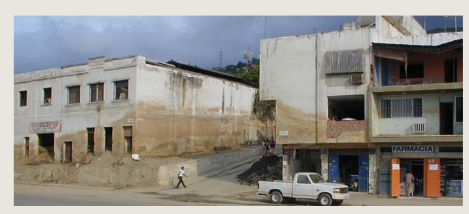
The mudline on these houses shows the height and shape of flood and debris flow deposits. The uphill street served as a conduit for water and debris thereby reducing damage to some of the buildings on this alluvial fan in La Guaira.