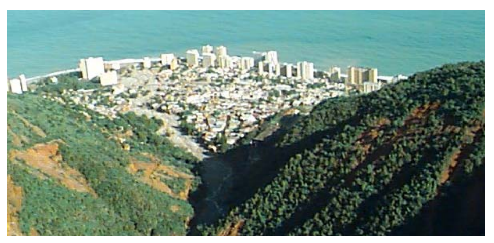
Highly developed alluvial fan, Caraballeda, Venezuela, aerial view looking north.

Large populations live on or near alluvial fans in locations such as Los Angeles, California, Salt Lake City, Utah, Denver, Colorado, Naples, Italy, and Vargas, Venezuela. In time scales spanning thousands of years, alluvial fans are dynamic zones of high geomorphic activity. Debris flows and flash floods occur episodically in these environments, and place many communities at high risk during intense and prolonged rainfall. Although scientists are constantly improving their ability to understand and delineate areas of high natural hazard, population expansion and development pressure have put more people at risk than ever before. Therefore, debris flow and flash flood hazard analysis is a critically