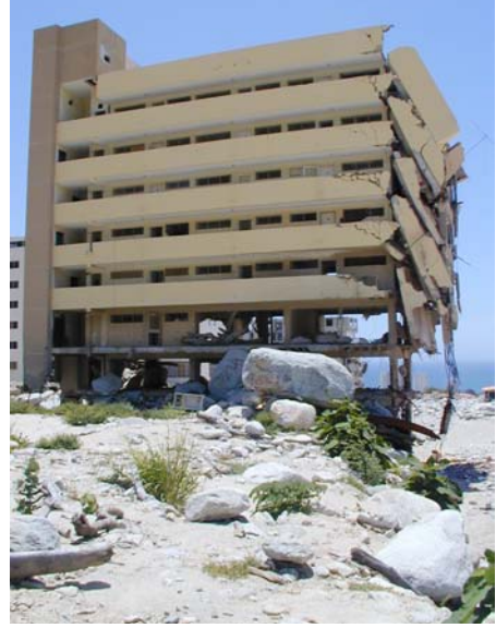
Debris flow damage to apartment building on alluvial fan, Caraballeda, Vargas, Venezuela. Boulders passed through the first two stories of the building.

The rainfall induced thousands of debris flows and other types of landslides in the coastal mountains, and downslope, these landslides coalesced into massive debris flows that moved rapidly through steep narrow canyons and onto the alluvial fans. Residents with homes on the alluvial fans described multiple floods and debris flows that began late on the night of December 15 and continued until the afternoon of December 16.