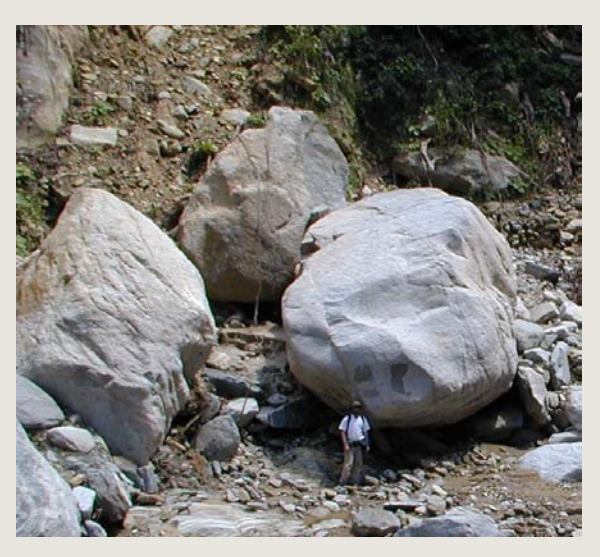
These large boulders, estimated at 300 to 400 tons each, were transported by the December 1999 debris flows near La Guaira.

settlements, the impacts of these types of disasters are likely to increase in the future. Building communities and other infrastructure on alluvial fans has changed high-intensity natural hydrologic processes into major lethal events. As stated by the Secretary General of the United Nations, Kofi Annan, "The term 'natural disaster' has become an increasingly anachronistic misnomer. In reality, human behavior transforms natural hazards into what should really be called unnatural disasters."