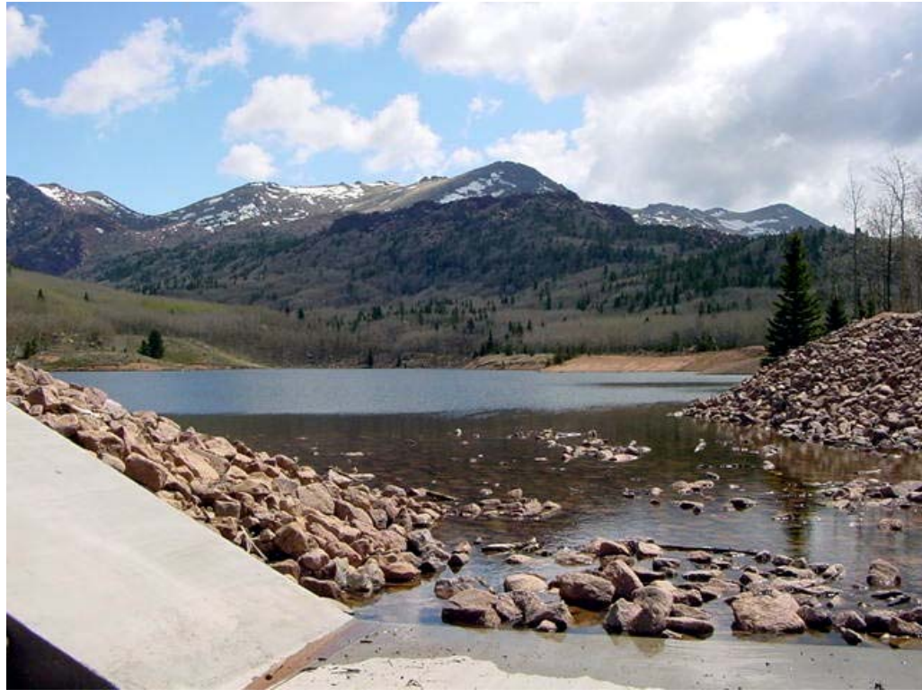
Victor Reservoir # 2, May 2003