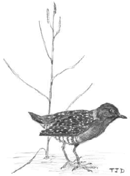
Black Rail by Thomas J. Danielson

When comparing sites (separate wetlands), data from the sites should represent equal effort. For example, it is inappropriate to make comparisons using seven survey points from a large site but only two survey points from a smaller site, or five visits to one site but only two to another during the same month. In such situations, compare the sites based on a single point or date chosen randomly from those at each site, or include a log of the area as a covariate in the statistical analysis. Alternatively, you might select from each wetland the point or date you found to have the highest counts of birds, or a point believed to be of exactly the same habitat type in all the surveyed sites. Such practices are not recom-