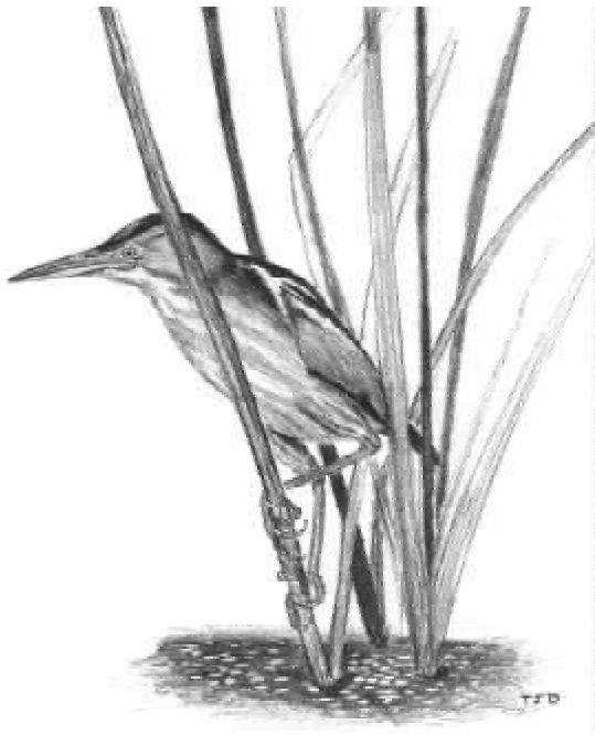
Least Bittern by Thomas J. Danielson

If three points per wetland are surveyed, approximately 100 easily accessible wetlands in a local area or small watershed can be visited three times in a typical field season. Only a fraction of this number of wetlands need be visited to initially develop and calibrate a regional IBI for a single wetland class.