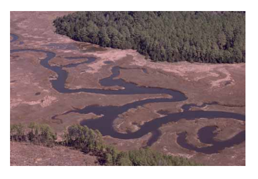
Resources & Tools