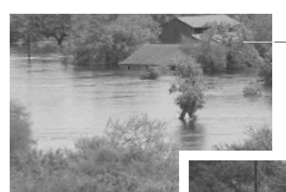
Flooding near Three Rivers, Texas, downstream of Choke Canyon Dam, September 11, 2002.