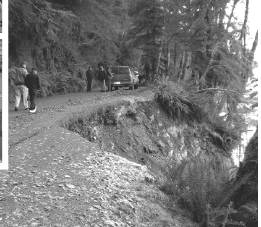
Geomorphological studies provide tribes with alternatives for protecting roads on the Avinalt River, Washington.