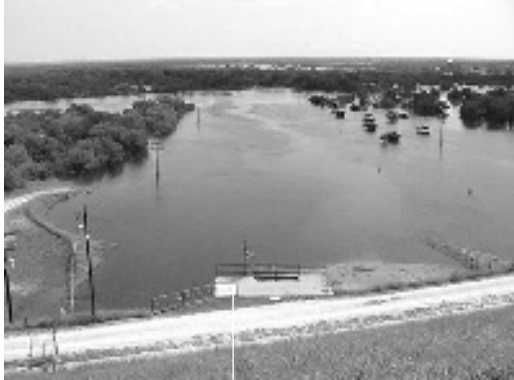
Choke Canyon Dam flooded area included picnic shelters in the State park.