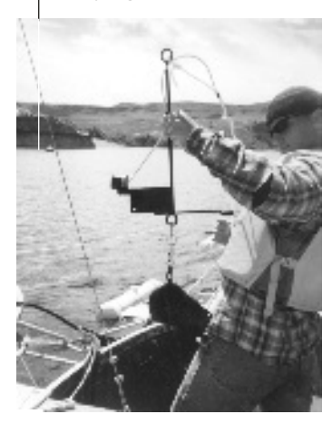
One facet of strobe light research investigates long-term damage to the vision system of fish exposed to high-intensity strobe light energy.

The research strobe light array at Grand Coulee is monitored for fish behavior and light intensity at varying distances.