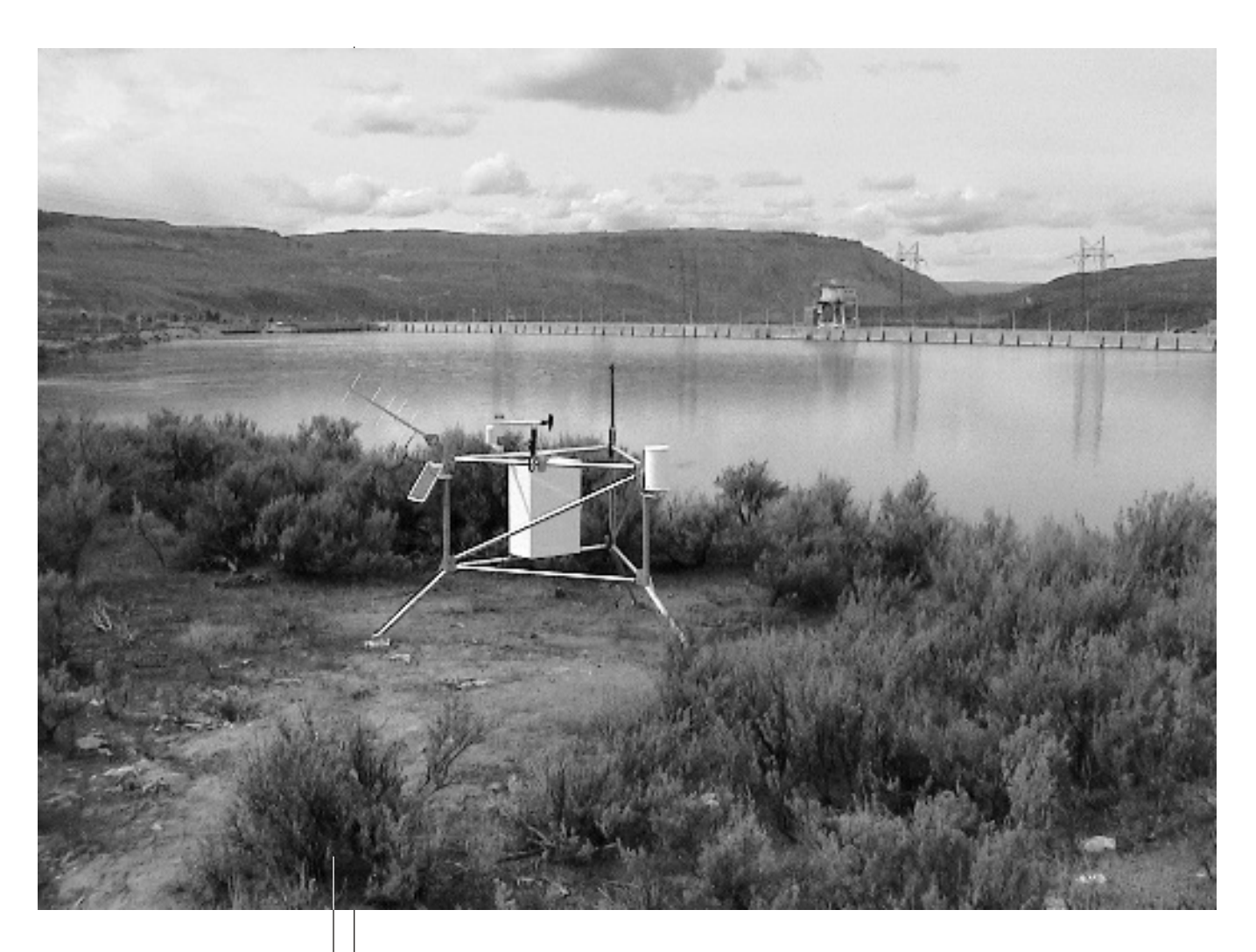
AgriMet station located at Chief Joseph Dam, Washington, to support dissolved gas and water temperature modeling efforts.