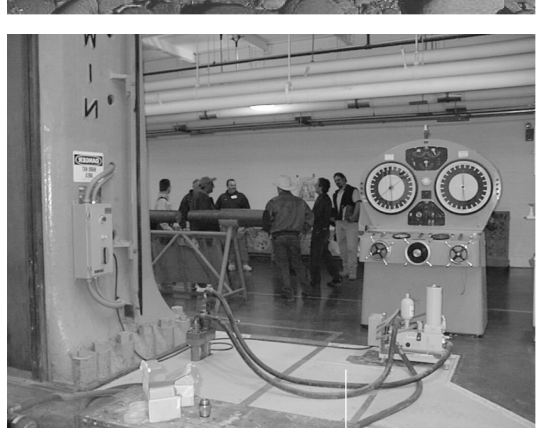
Tribal water management workshops share technology in Denver, Colorado.