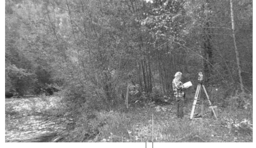
Native American students study a permanent network of 60 cross sections to help monitor channel changes over time.

provided $ 3.4 million to support technical assistance activities for 62 tribes, representing a wide range of new and continuing technical support. These assistance activities include both those that are an "end in themselves," as well as those that lay the groundwork for future on-reservation water development activities.