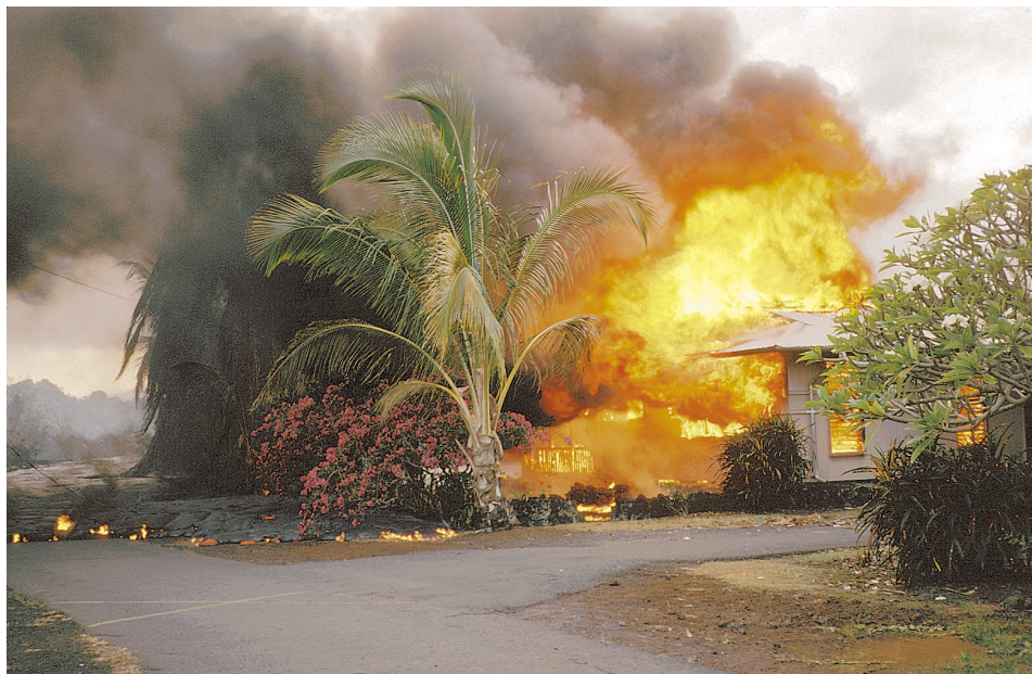
In 1990, flows of lava from Kilauea Volcano on the Island of Hawai‘i invaded Kalapana, a coastal community treasured for its historic sites and black-sand beaches. Although the residents were able to evacuate safely, their homes were incinerated, and by the end of that year all of Kalapana lay buried under 50 feet of lava. In the past 1,100 years, more than 90% of Kilauea’s surface has been covered by new lava flows. Ancient Hawaiian communities were able to easily relocate when threatened by lava flows, but modern communities, with their greater dependence on permanent structures, highways, and utilities, are more vulnerable.

People on the Island of Hawai‘i face many hazards that come with living on or near active volcanoes. These include lava flows, explosive eruptions, volcanic smog, damaging earthquakes, and tsunamis (giant seawaves). As the population of the island grows, the task of reducing the risk from volcano hazards becomes increasingly difficult. To help protect lives and property, U.S. Geological Survey (USGS) scientists at the Hawaiian Volcano Observatory closely monitor and study Hawai‘i’s volcanoes and issue timely warnings of hazardous activity.