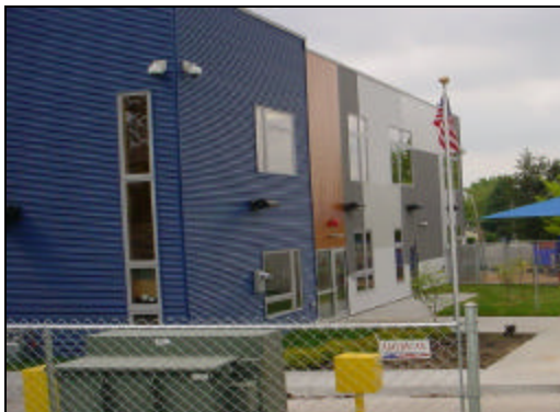
Pictured above: Newly moved Uncle Sam’s Federal Child Care Center, Des Moines, IA

The Courtyard Kids Child Development Center, located on the site of the new U.S. Courthouse and Federal Building in Central Islip, New York, opened its doors on February 3 rd , 2003. The 7,000 square foot stand-alone center serves 66 children and is managed by Imagine Early Learning Centers. The building is arranged so that each classroom exits into a beautiful protected playground that is keeping with the contemporary design of the center. One of the challenges of the design was to ensure its compatibility with the much-honored and very contemporary Courthouse.