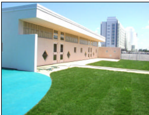
Pictured below: Newly opened Courthouse Kids, Islip Long Island, NY