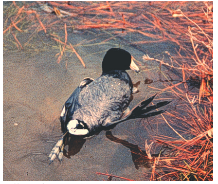
Affected coot.

The disease, termed Avian Vacuolar Myelinopathy (AVM), was first detected in 1994, when 29 bald eagles were found dead during the fall and winter at De Gray Lake in southwestern Arkansas. USGS National Wildlife Health Center scientists described the disease, which had never before been documented in wildlife.