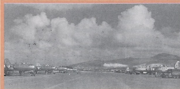
Saipan's Isely Airfield as it looked in November 1944 with B29s