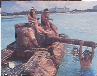
Swimming around WWII tank in beachhead Green I area (Saipan)