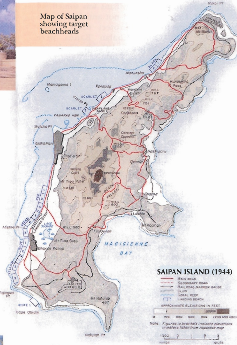
Map of Saipan showing target beachheads