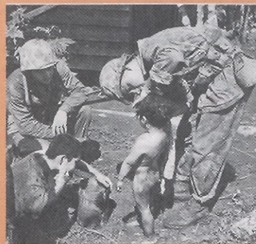
Tending to Okinawan civilians on Tinian