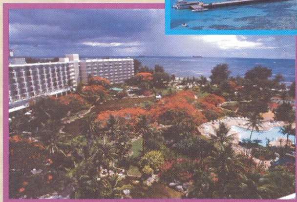
Hyatt Regency Hotel, Garapan