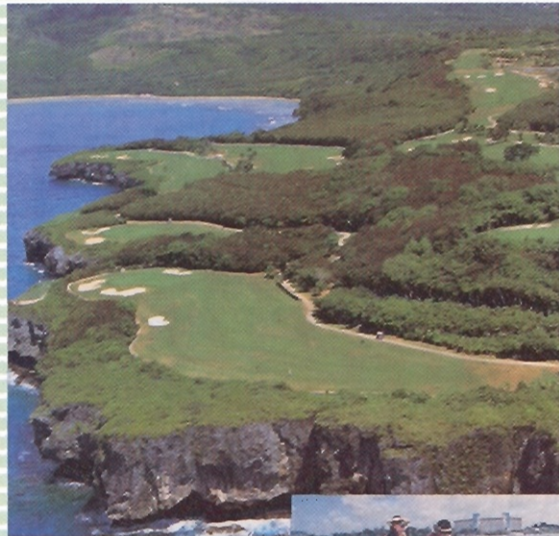
Kingfisher Golf Resort (Saipan)