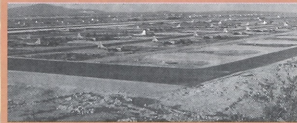
Northfield on Tinian became the busiest airfield in the world with planes taking off every 45 seconds