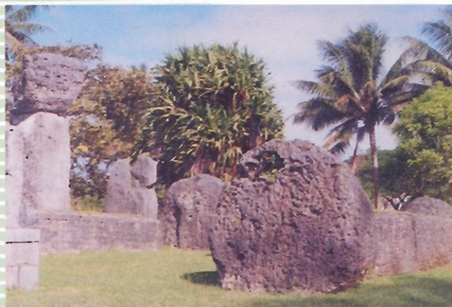
House of Taga, an ancient Chamorro latte site on Tinian, has survived centuries of conflict and can still be visited today.