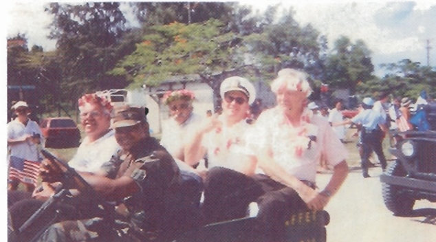
WWII veterans on parade during the Commemoration of the 50th Anniversary of the Battle of Saipan

BROCHURE FUNDED BY ARIZONA MEMORIAL ASSOCIATION