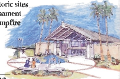
Visitors Center and WWII Exhibit Hall - 2004