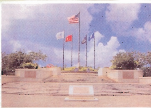
Court of Honor and Flag Circle (American Memorial Park, Saipan)