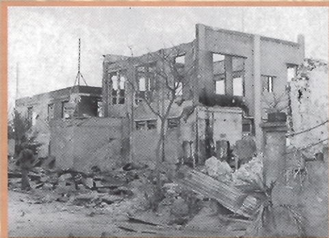
Saipan and Tinian in ruins