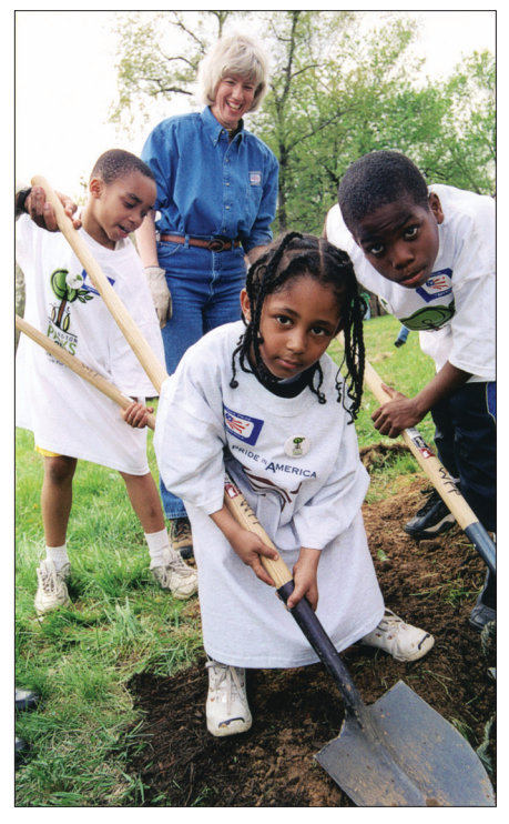
Celebrating the launch of Take Pride in April 2003, Interior Secretary Norton helps schoolchildren plant trees along a tributary of the Anacostia River in Washington, DC.